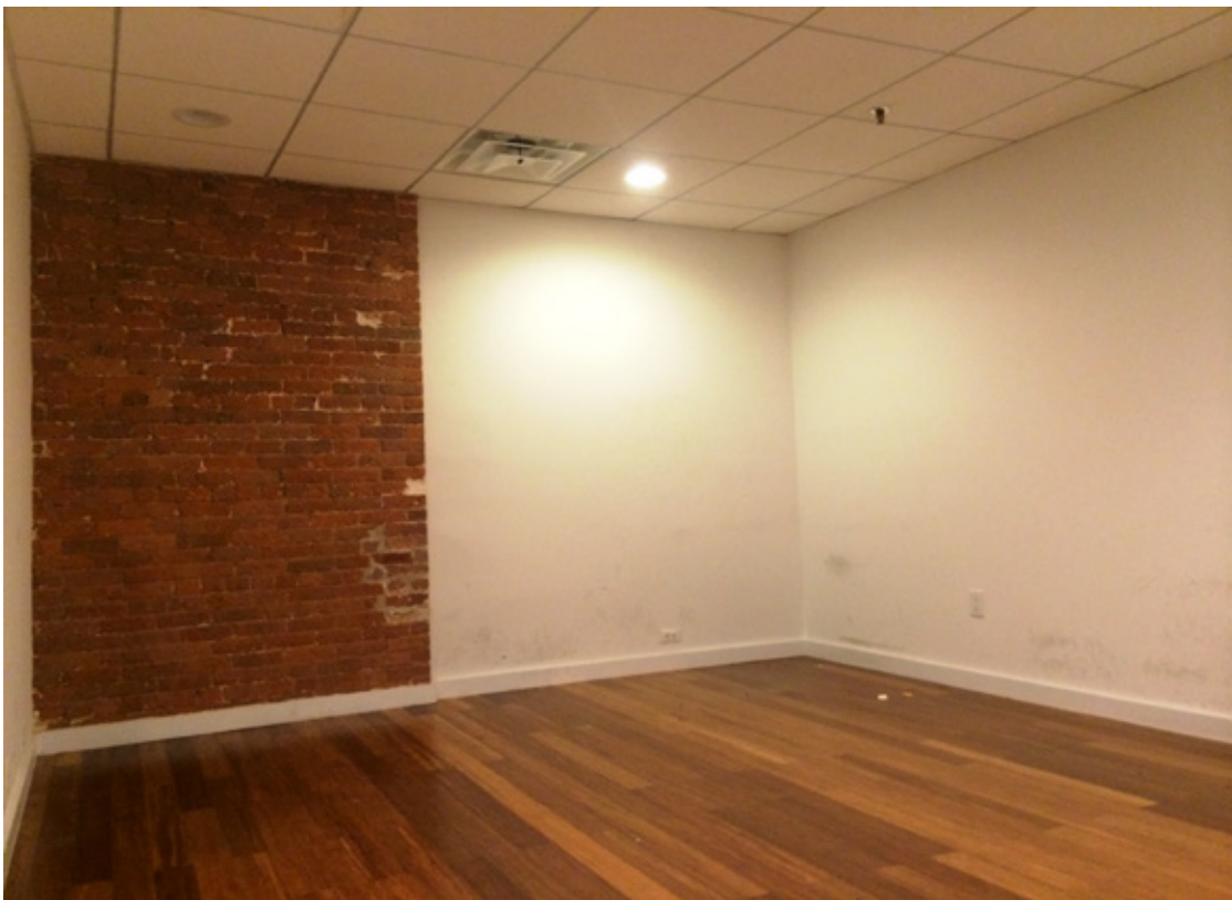
Professional Office Space | 225 SQ RSF Available